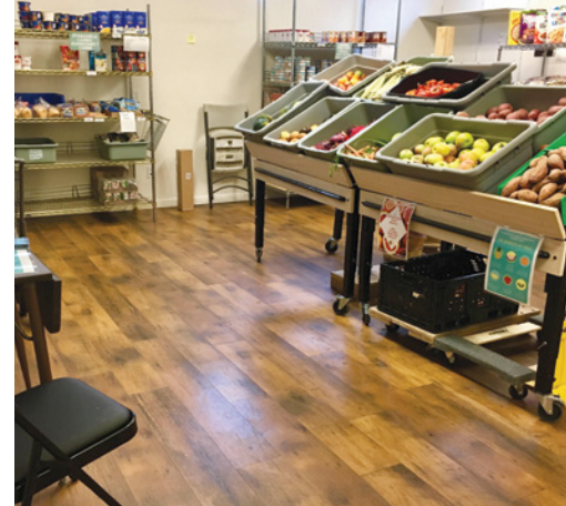
EFAA's redesigned food pantry allows participants to shop on their own and has increased storage for fresh produce.