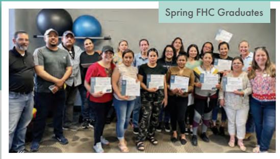
Spring FHC Graduates