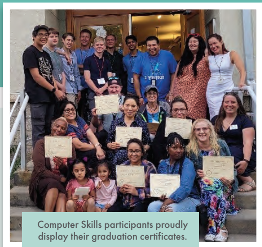
Computer Skills participants proudly display their graduation certificates.

Congratulations to the 25 English and Spanish language participants who completed the basic computer/digital literacy classes at EFAA in June. Over the course of 8 weeks, these dedicated participants learned the basics of email, how to create documents and presentations, navigate access to online resources, and protect against online fraud. On the final day of class, participants gave presentations they prepared on their Chromebooks, about something special to them. The presentations provided an opportunity for the students to demonstrate some of the computer skills they learned during the training, and support each other as they shared their personal interests. Upon completion of the program, participants received a graduate certificate and got to keep the Chromebook they used during the class.